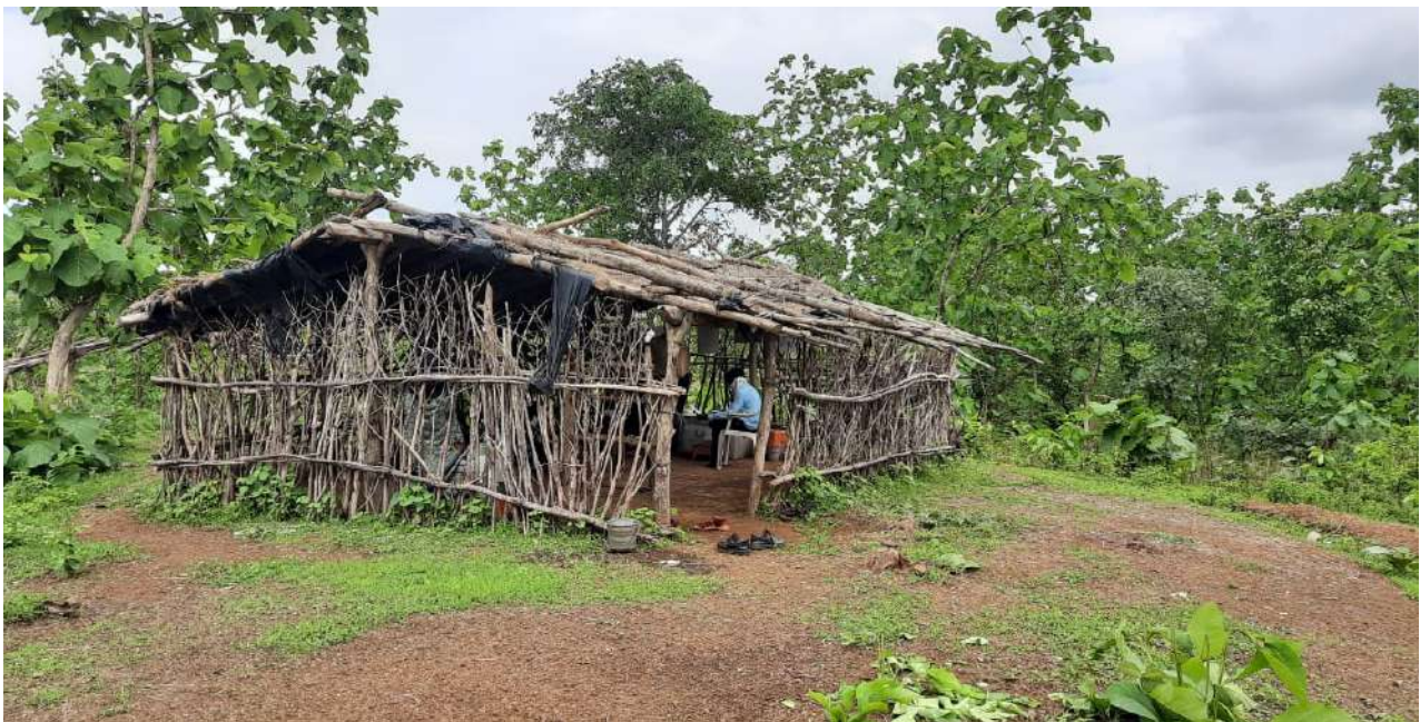
A Temple of Education created by the Community.

Pipalkhunt is one of the most vast block under the SKB programme, in terms of area. The block is surrounded by dense forest and literacy levels are the least in Rajasthan. Under the programme Jaliya Hamlet was identified to have more than 30 out of school/ drop out or irregular girl children. Thus following all the steps, it was decided to initiate a SKB in Jaliya hamlet. Challenge was the non availability of suitable places to initiate the study.