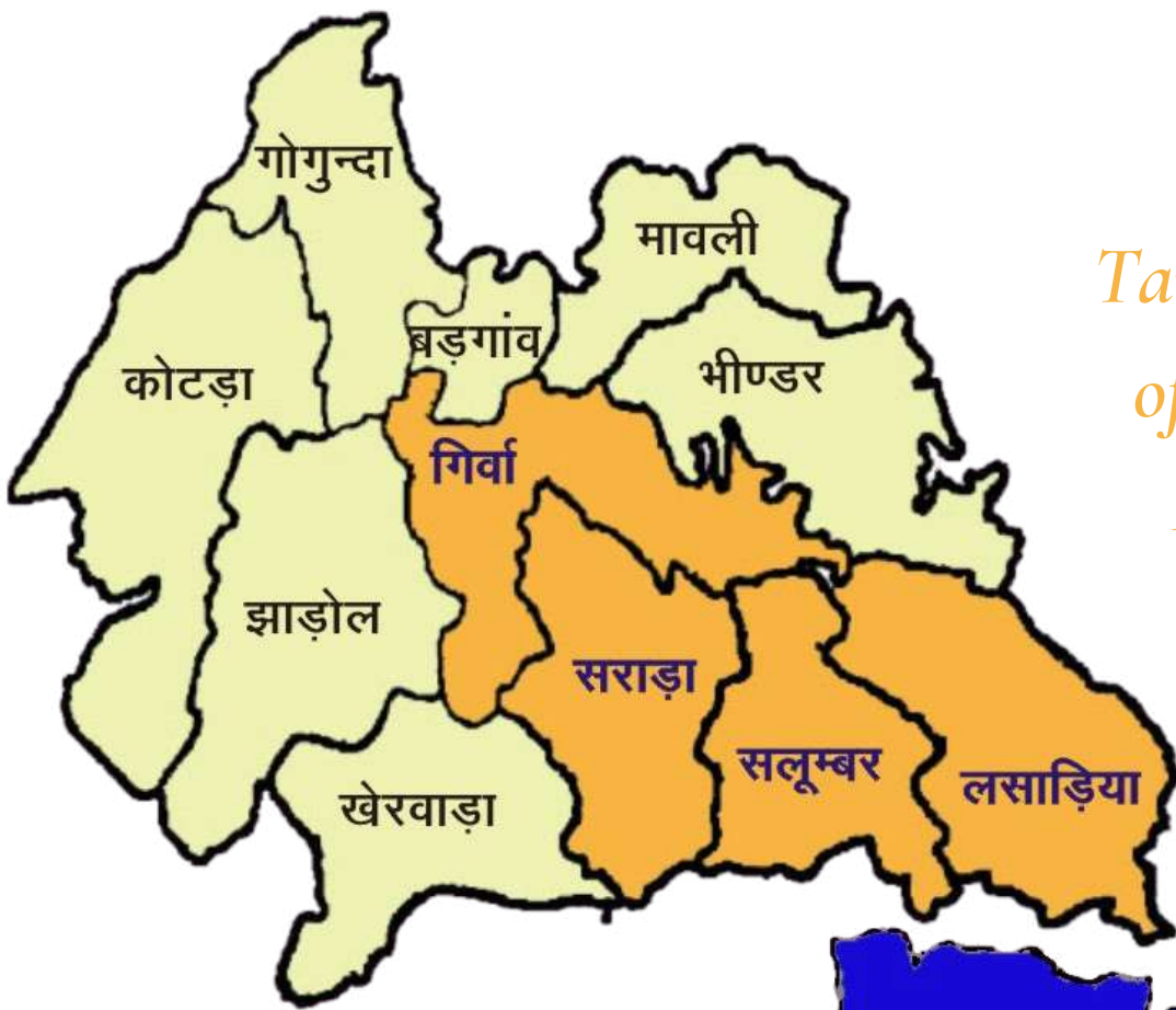
Target Blocks of Udaipur District