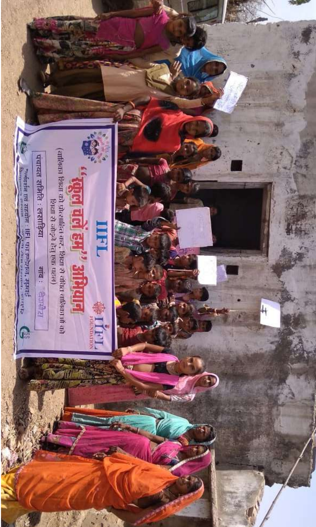
Community Women Gathered to Support the Campaign.