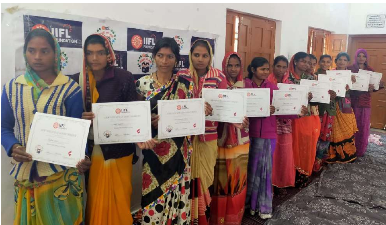
Self Defense Training to DAKSHAs.

To sum, all the training has contributed to Daksha's personal and teaching development. These interventions will go a long way in making Daksha's life more meaningful and constructive, beyond the present programme.