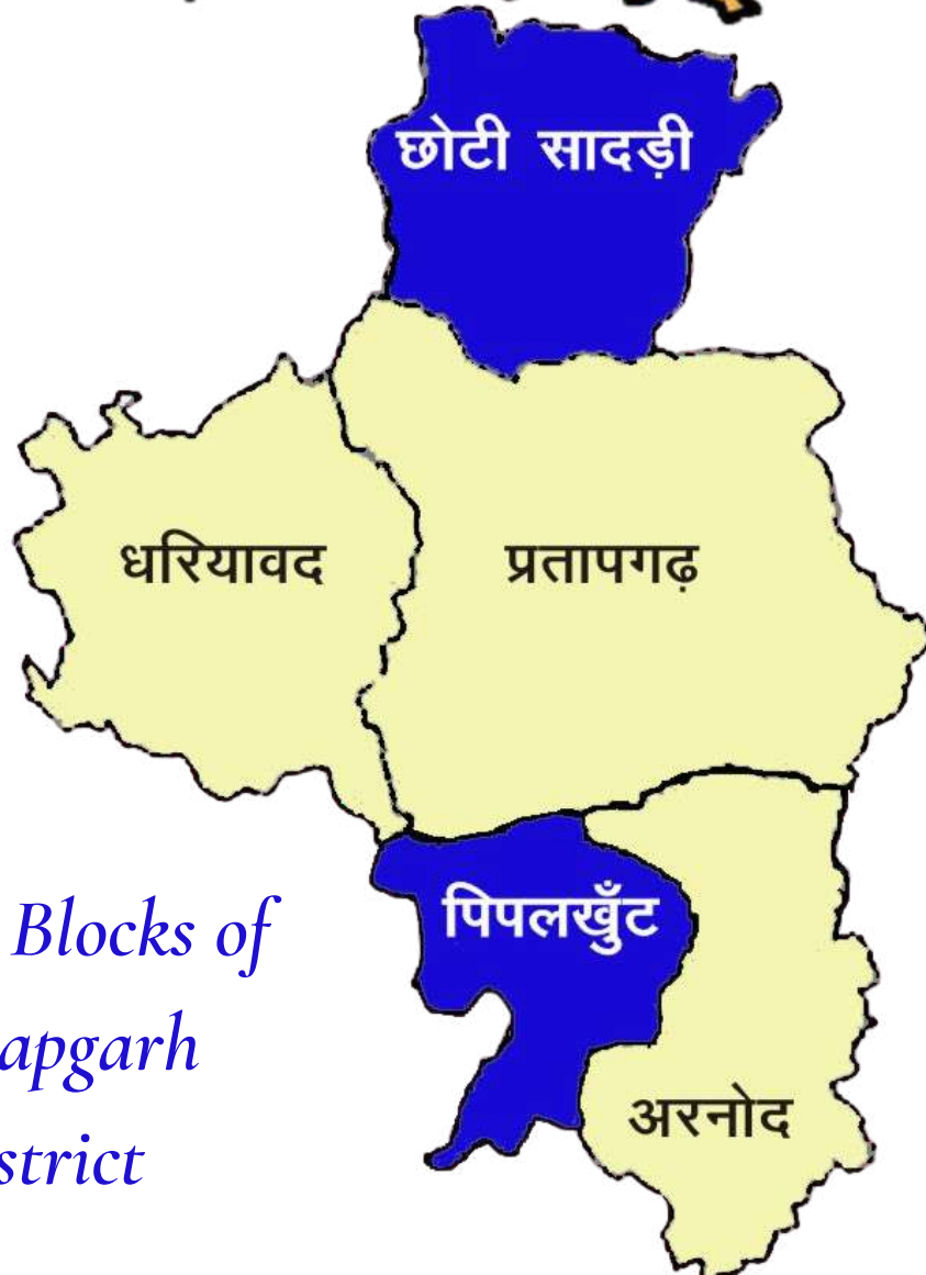
Target Blocks of Pratapgarh District