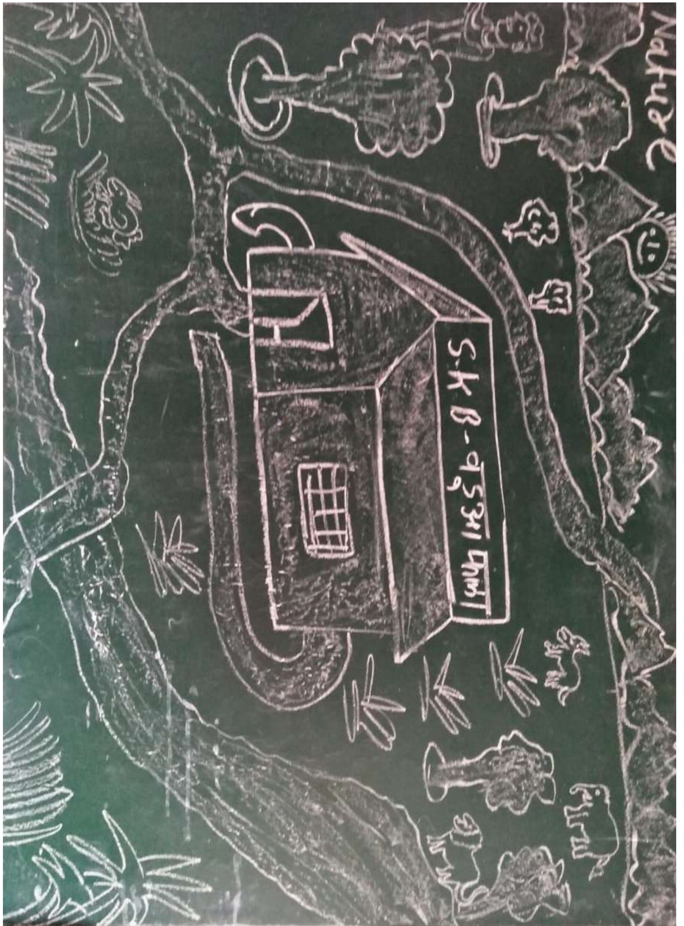
A Drawing by SKB Girls at Vadua Fala